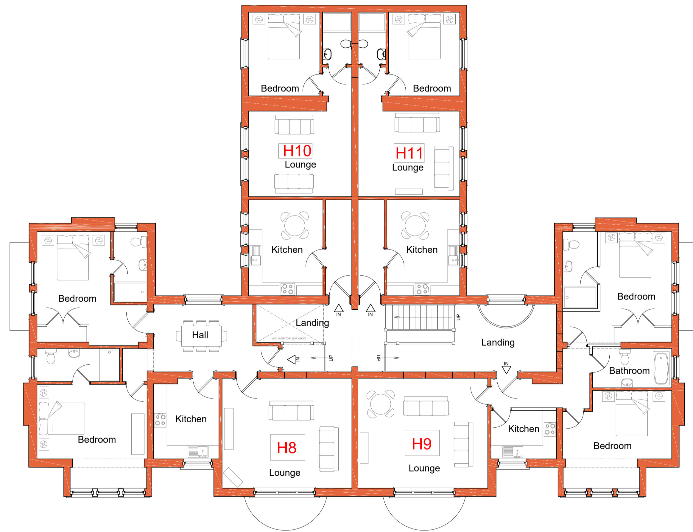
Proposed First Floor 1:100 Scale